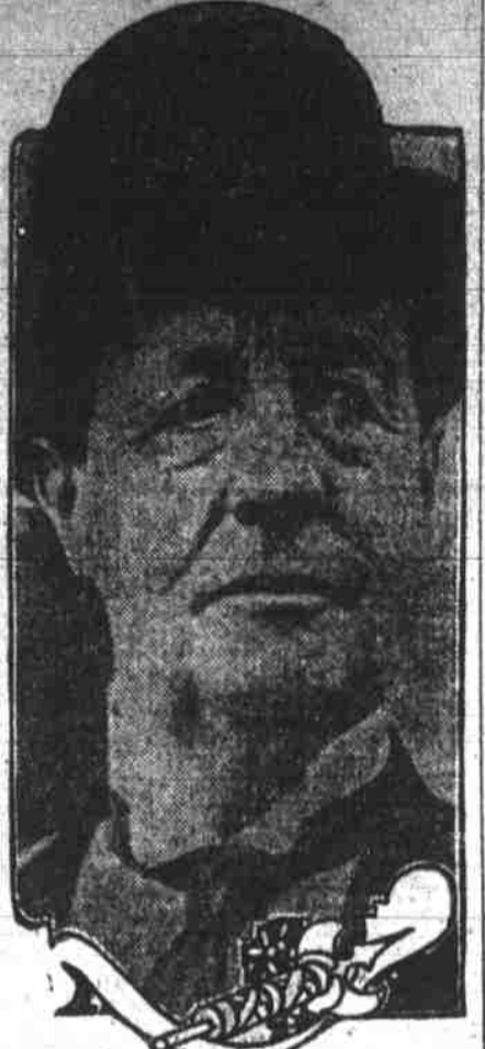
Senator Francis G. Newlands, of Nevada.