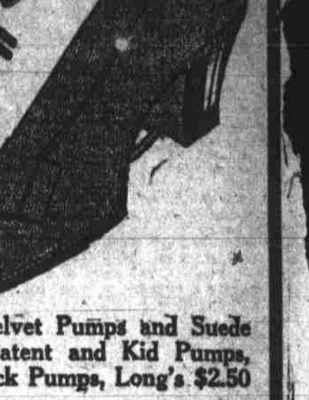
Dressy Velvet Pumps and Suede Pumps, Patent and Kid Pumps, White Buck Pumps, Long's $2.50