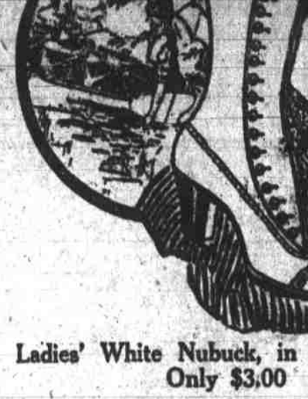
Ladies' White Nubuck, in Five Styles, Only $3.00