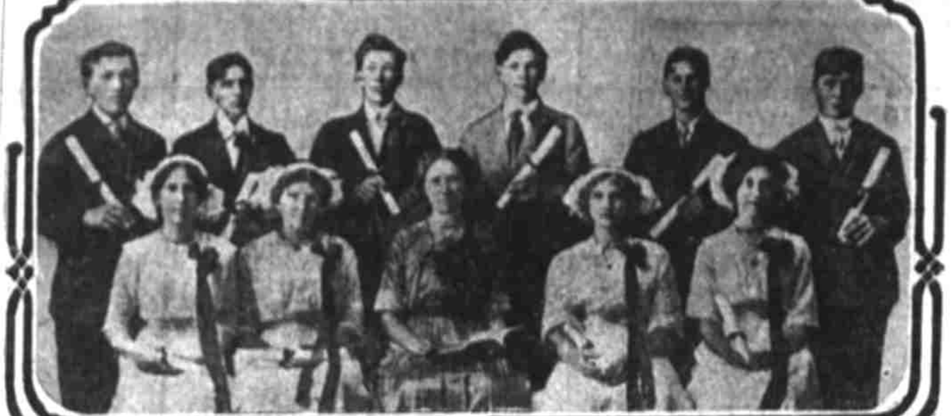
Central Howell school graduates at Silverton, Or

Every Member of This Eighth Grade Class Is Successful happened between 2 and 2 o'clock in the than packed the successor and find,