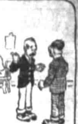
"Old skinflint's wife has turned on all the gas jets in the house and tried to kill herself. Will you break the news to him?"