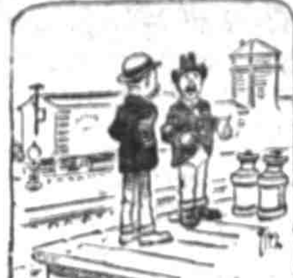
Drommer—"Do your ancestors come over in the Mayflower? Ah, they were a brave lot!"