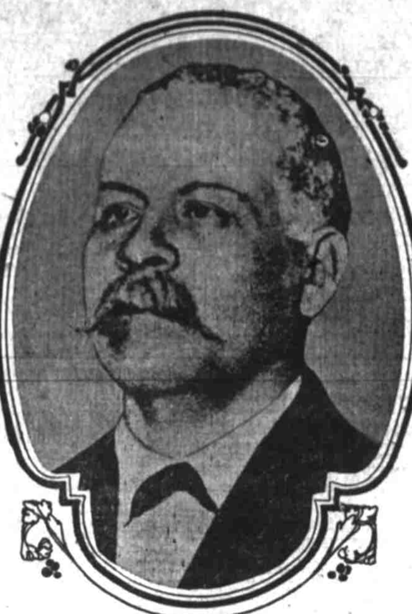
Emilio Vasquez Gomez, who has established a provisional government at Juarez.