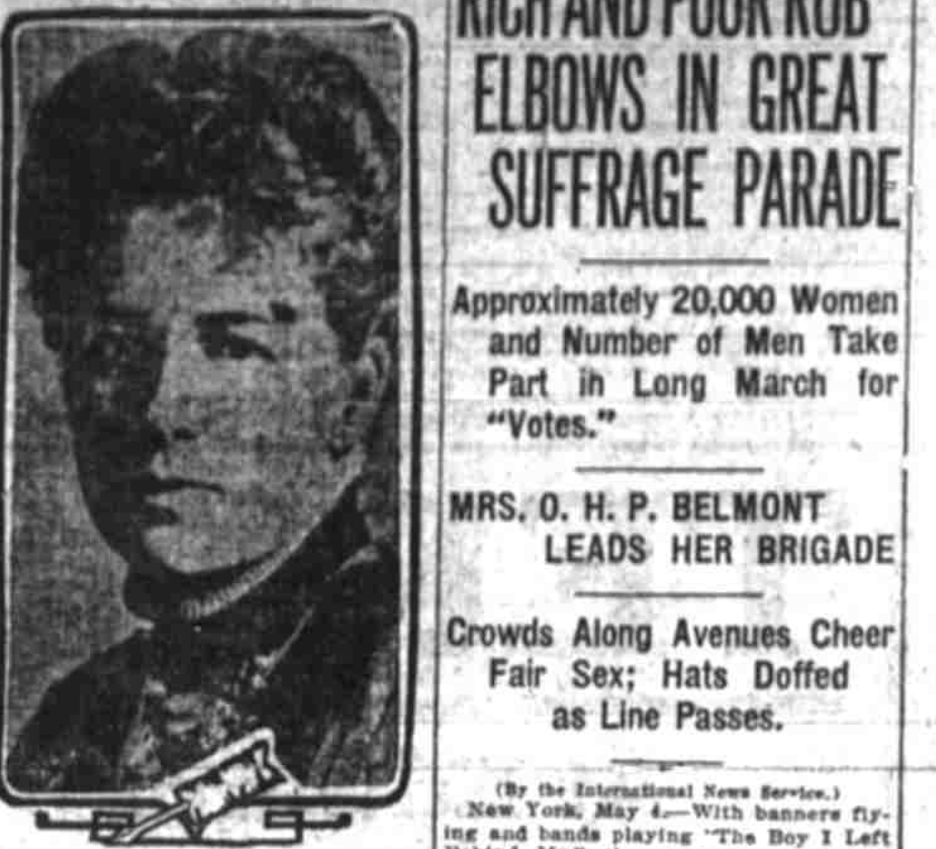
Mrs. Harriet Stanton Blatch, who presided at Carnegie hall suffrage meeting in New York last night.