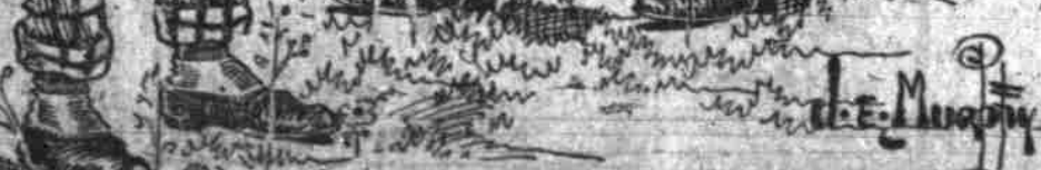
King George Views Exposition Plans.