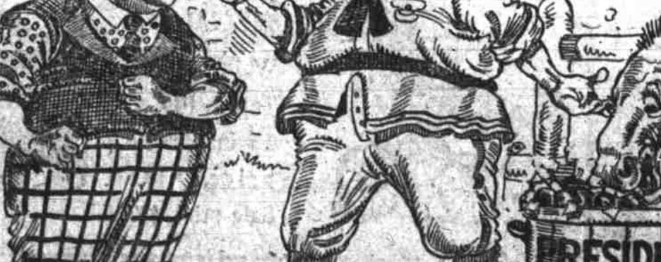
Warm Welcome Given Colonel in Maryland.