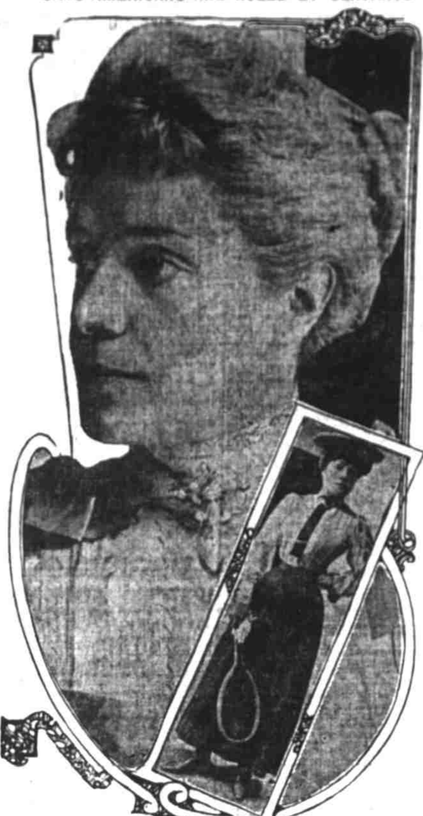
Infanta Eulalia of Spain.