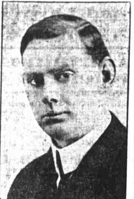
Vote for No. 137.