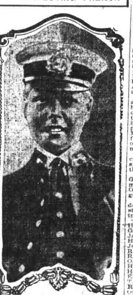
Prince of Wales