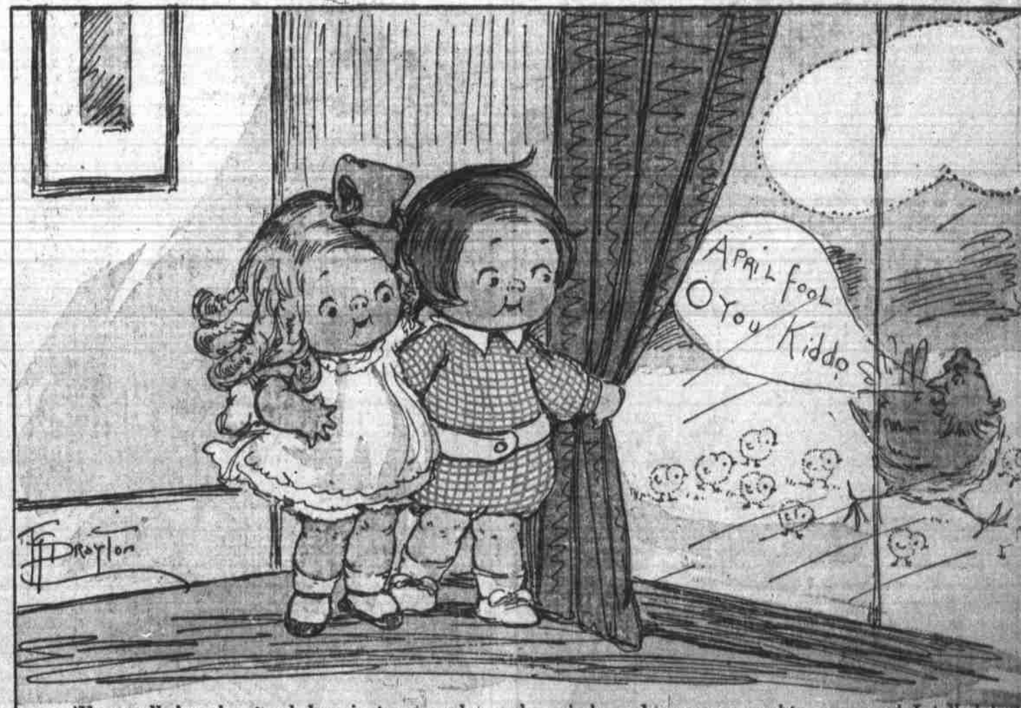
'En—well, 'en she standed us in two corners an'—an' she sed 'we was naughty—an'—an' I telled her 'bout the Humpty Dumptys—an'—an'—jus' 'en I looked out the winder an' ther' comed Gwendylin 'Vangelin May's old hen wif a lot o' 'ittle yellow chickies, an' she winked at me an' she sed, "Oh—Ho! April Fool, Oh you Kiddo!"

(Copyright, 1912, by The North American Company.)