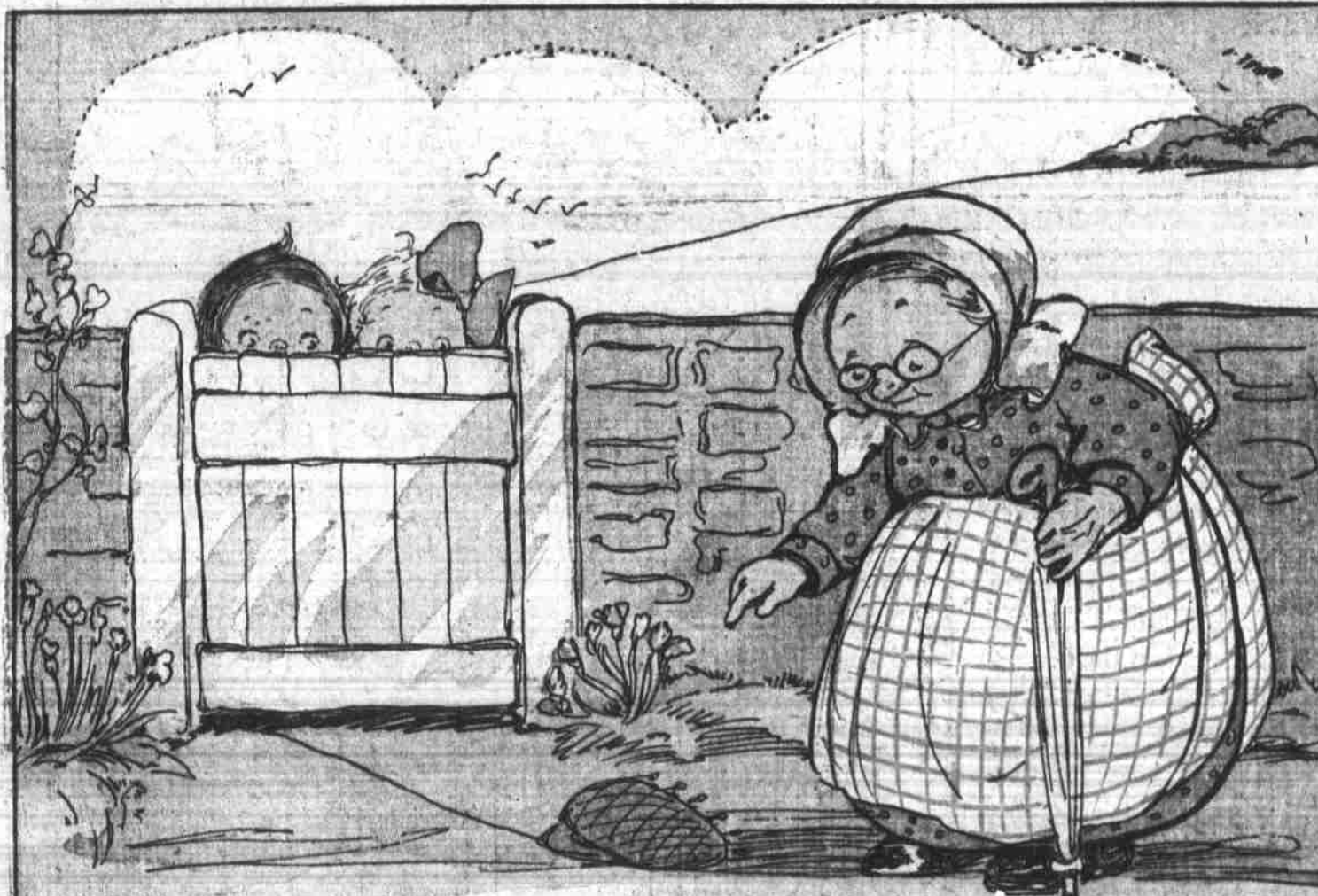
An' 'en 'ey tooked Gwendylin 'Vangelin May's Mamma's best pocketbook an' 'ey tied a string to it an' 'ey putted it on the pa'ment, an' when a poor old lady goed to pick it up 'ey pulled the string an' screamed, "April Fool! April Fool!" orful impident.