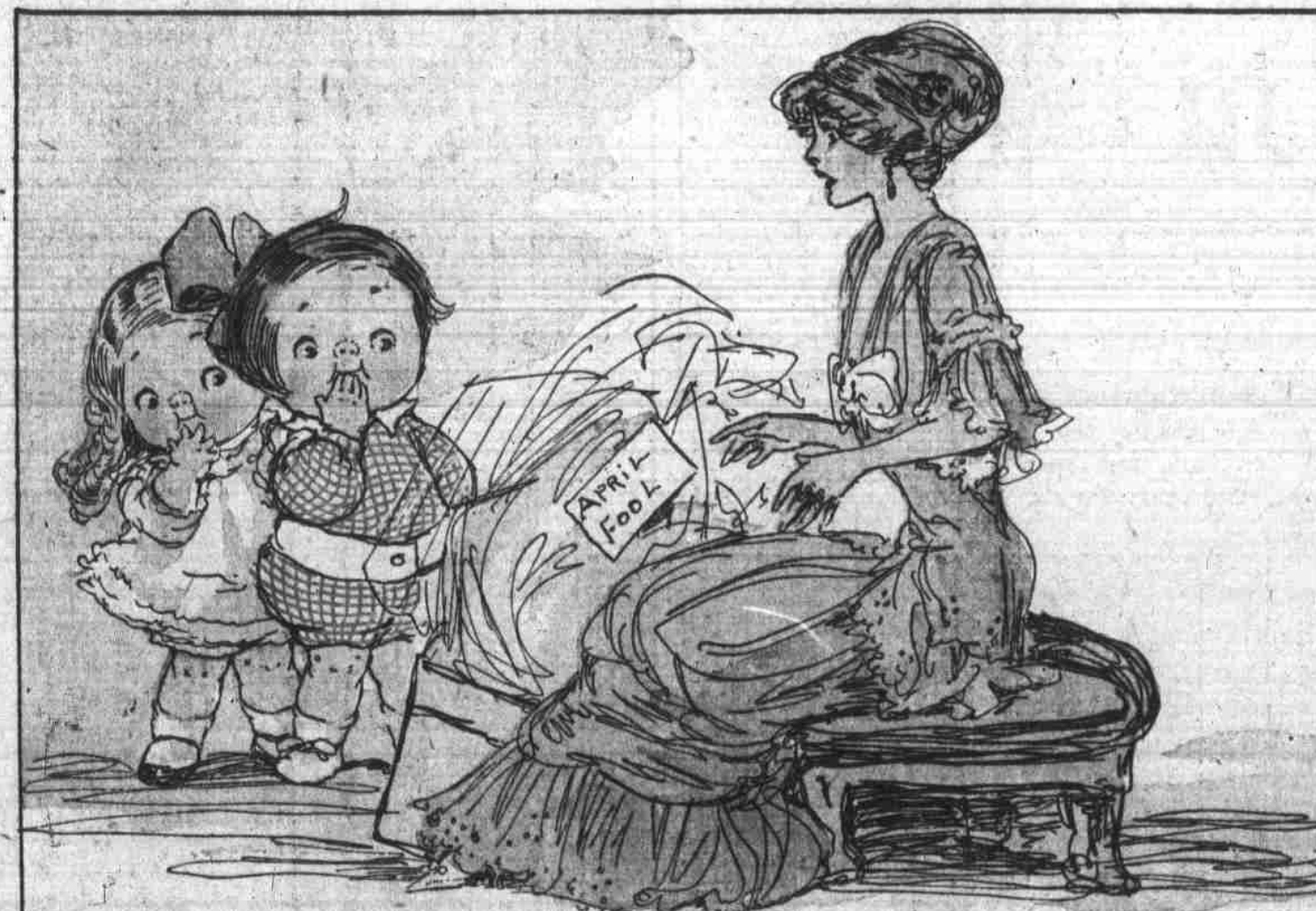
'En 'ey gotted a big box for mine dee-ar Muvver an' maked me'n Gwendylin 'Vangelin May give it to her, an' she opened it an'—an' opened it—an' opened it—an' lots an' lots o' paper—an' muffin in the box, an' those bad ol' Humpty Dumptys sed, "April Fool!" an' mine dee-ar Muvver finked it was us.