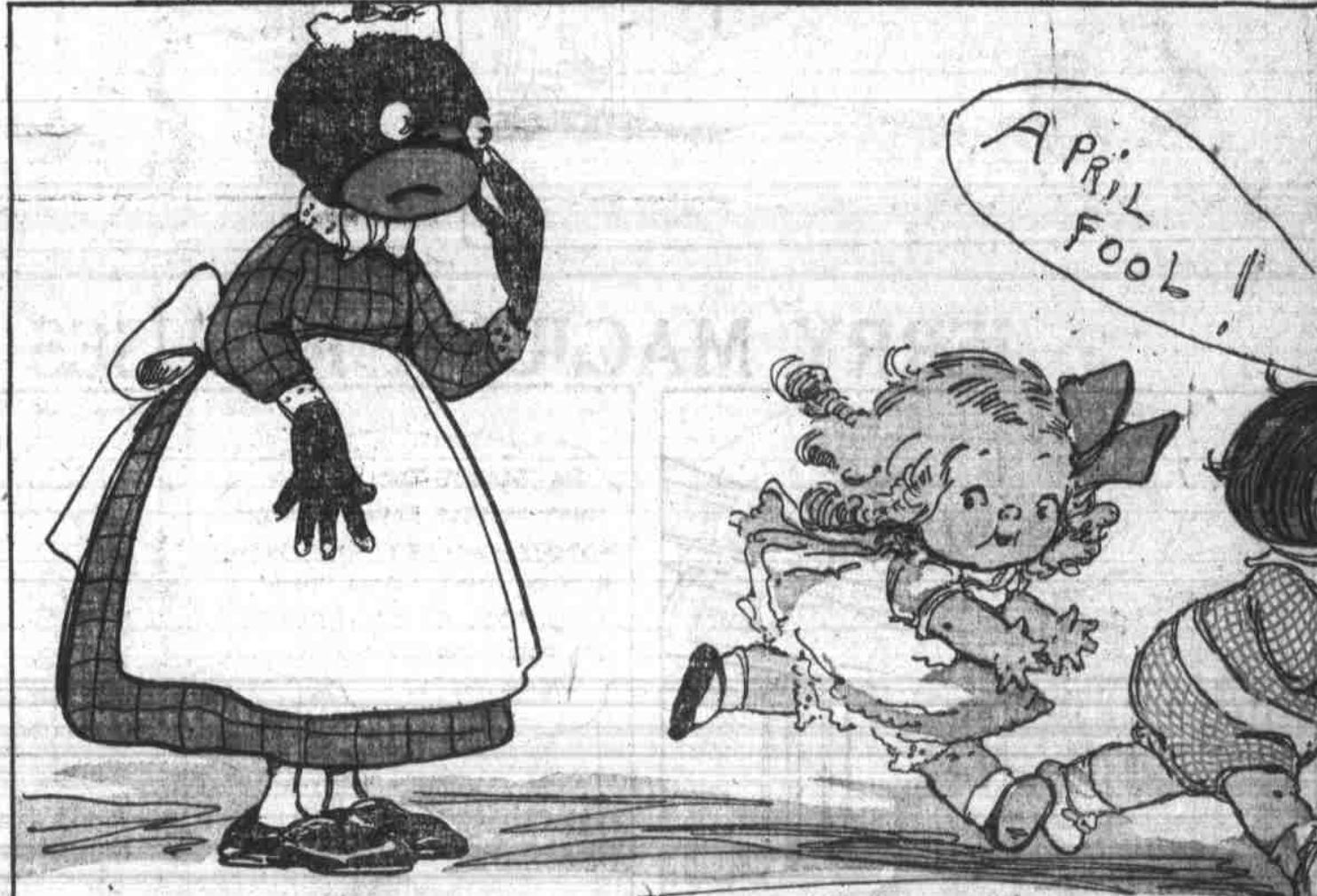
'En 'ey gotted a box o' chocklets wif cotton inside o' 'em an' offered some or maked Gwendylin 'Vangelin May offer some to Dina, their new girl, an' 'en when she bited one an' hurt her tooths, an' her feelin's, those bad Humpty Dumptys maked us run away an' 'ey sed, "April Fool!"