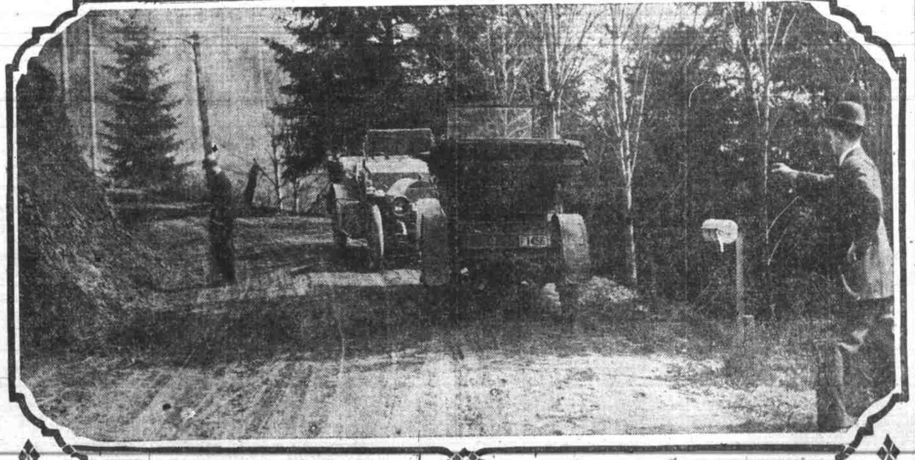
Man Pointing, at right, shows position of slayer when fatal shots were fired. He is believed to have been crouching behind mail box of F. L. Crane, shown in picture, until auto passed. Rear auto shows position of machine in which men were killed when he opened fire.