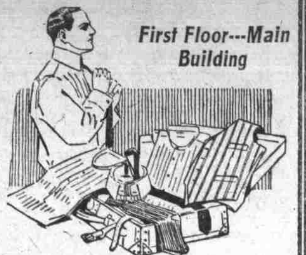
First Floor—Main Building

100 Doz. Men's $1 Silk Knit Ties 65c Really the best values we ever offered! Heavy, silk-knitted Four-in-Hands, closely woven, bound to keep their shape. And they're exclusive patterns—never before shown. Smart cross-stripes in every color. See our big display in Morrison-street window. Regular $1 Ties, Saturday