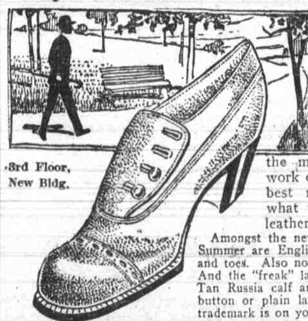
3rd Floor, New Bldg.

THE "Knox" trademark on Men's Shoes signifies higher quality than you've learned to expect in recent years for $4, $4.50 and $5.