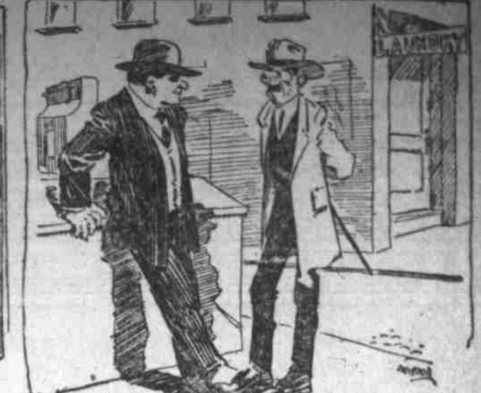
GREAT AT DISSOLVING.

Hampton—"I hear the owners of that laundry are going to dissolve partnership." Rhodes—"That's their long suit; they dissolved all the shirts I ever sent them."