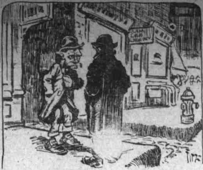
TWAS ON HIM.

First Cook—"Have you heard from Bill since he stole that auto?" Second Cook—"Yes. They caught him with the goods on him—upside down."