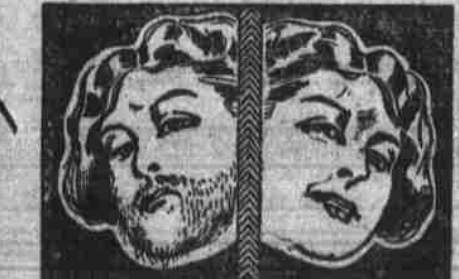
These Hairs Will Be Gone in 3 Minutes!" "Haire

Wonderful New Preparation, Unlike Anything Ever Known Before.