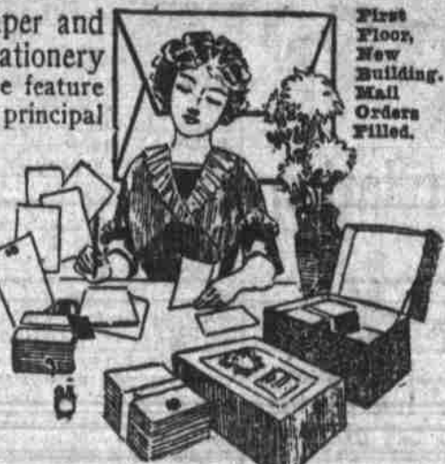
First Floor, New Building, Mail Orders Filled.

The Highland linen, Irish delph or Canterbury linen, in white, blue, pink, buff or gray, with a two-initial monogram in gold or colors. Extraordinary Easter special 42¢.