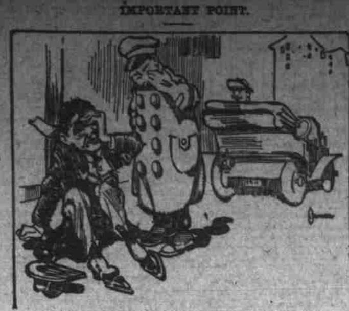
wrotorist-"I'm sorry I ran into you." Victim-"What? Did it hurt the car?"