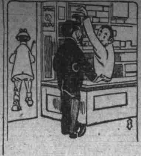
Druggist-'Didn't we have the kind of cigarettes that chappy wanted?" Drug Clerk—"No; our stock is pretty low; we only have about 648 brands."