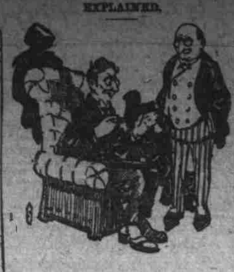
bookkeeper in a cleaning and dyeing establishment."