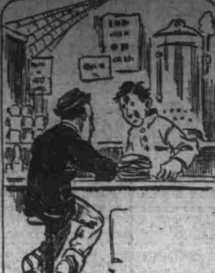
De Estabate—"Do you call these pa-pery looking objects panaches?" Water—"If I didn't I'd lose my job."