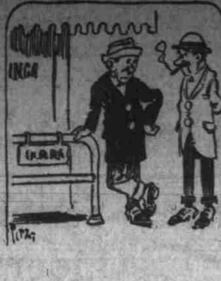
Friend—"I hear you've been on newspapers all winter?" Side Partner—"Yep, use 'em for inches to keep my feet warm."