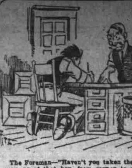
The Foreman—"Haven't you taken the diagonal measurement of that box, from corner to corner? I'm in a hurry!" The New Shipping Clerk—"Presently, sir. I have the measurements of the side and end, and I've squared them and added the squares and I'll have the result you wish in a few minutes."