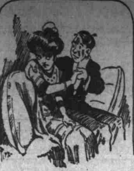
He—"Will you marry me?" She—"No; but we can still be friends!" He—"Always. I can never forget your kindness."