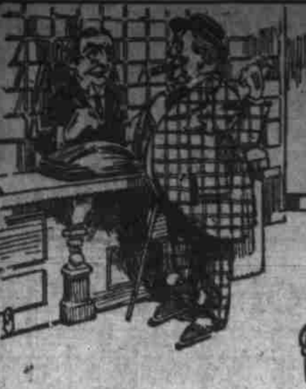
Cigar Salesman—"Is Howler generous?" Night Clerk—"Gives the porter a $3 tip for brushing his $3 hat."