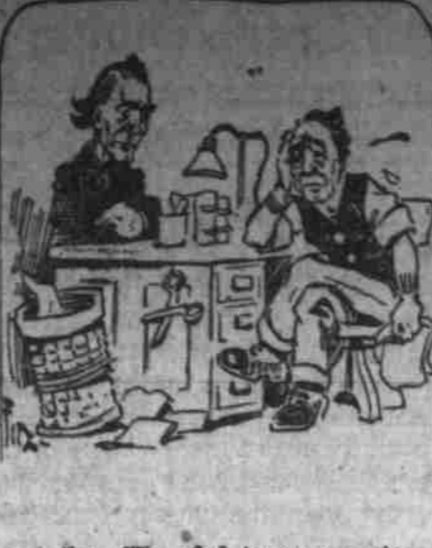
Author—"I'm glad to see my story make you weep. What part do you think so sad?" Editor—"The part where the hero has to sell his watch fob to buy a gold-headed walking stick."