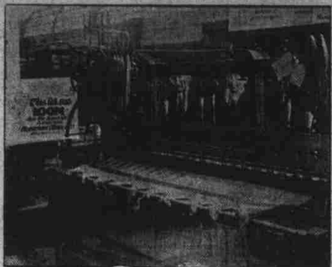
Photograph of Loom from Thos. Kay Woolen Mills, Salem, in operation in Dress Goods Dept.

In a special auditorium on the Fifth Floor, beginning at 1:30 tomorrow afternoon, 100 new Kiser Hand-Colored Photographs of Oregon will be thrown on the screen for benefit of Exposition visitors. Plenty of seats—come and see many new views of Oregon's beautiful mountain scenery, lakes, rivers and famous spots.