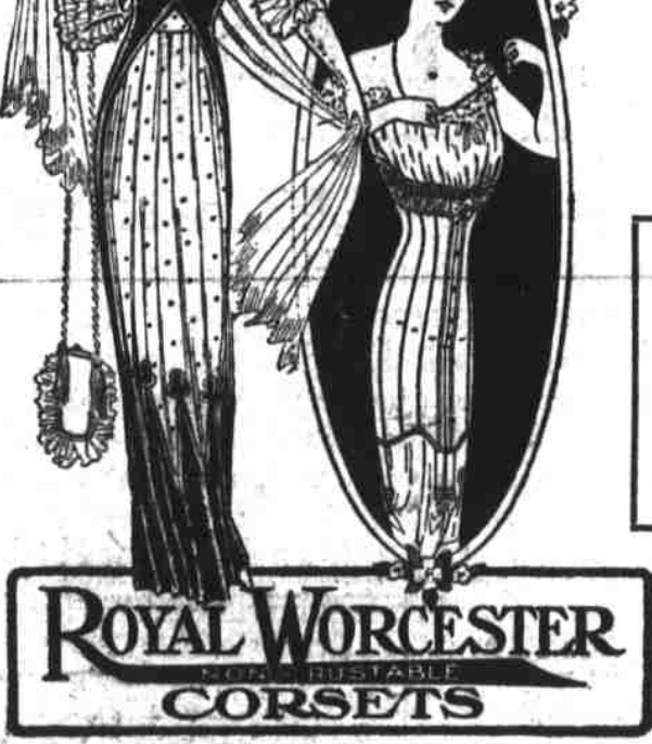
See Four Windows on

Bon Ton Corsets are made of various kinds of materials-from the plain sheer Imported Batiste to the most gorgeously trimmed Silk Brochets. All are boned with non-rustible, non-breakable Walohn, Fittings at your home by appointment without extra charge. You are invited to call and examine these corsets.