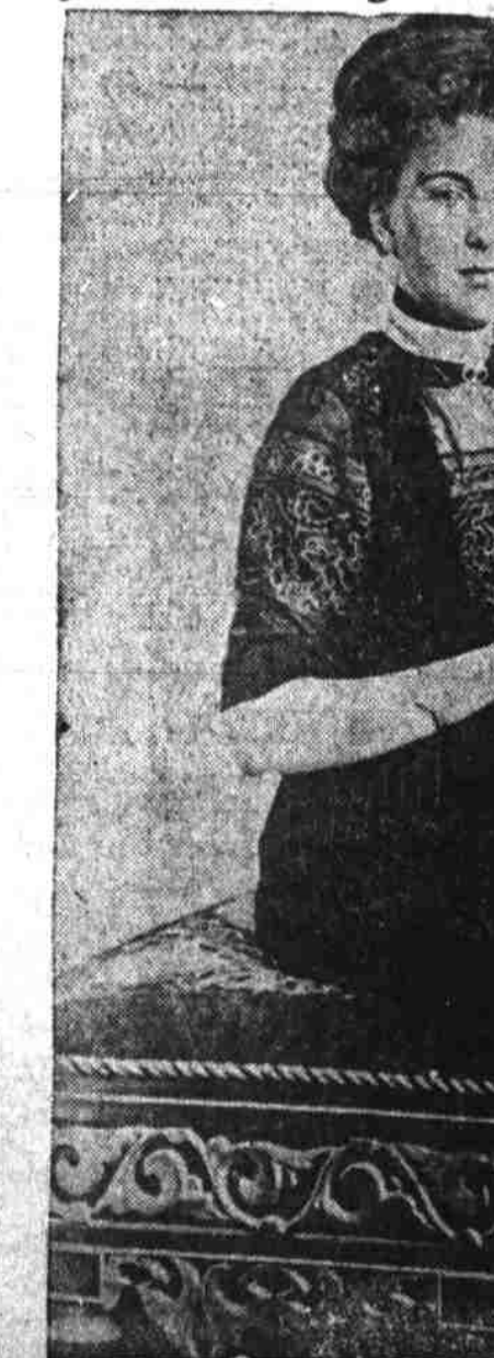
Madrid, Spain, Jan. 20.—Queen Victoria (Ena) is up and about again superintending the welfare of her

rapidly growing family. The latest arrival, a daughter, is a lusty, healthy infant.