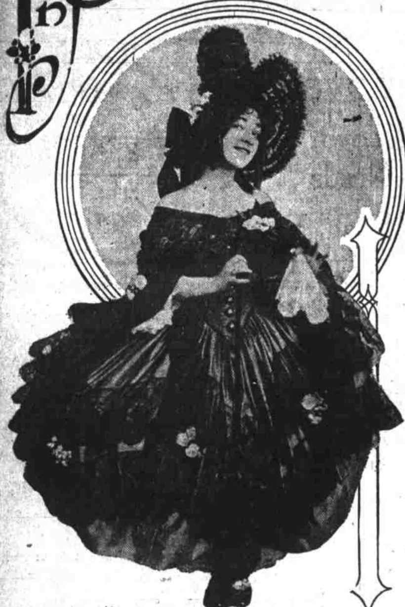
JULIET AT THE ORPHEUM