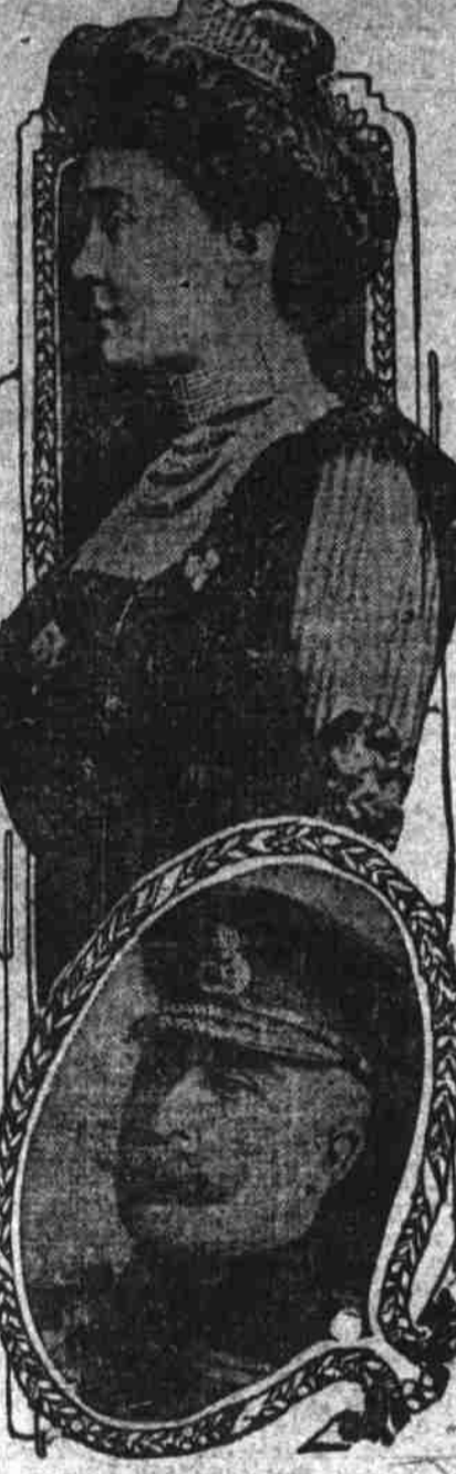
Duke and Duchess of Connaught.