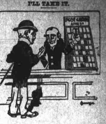
Man at Counter—"Have you a picture postcard of Swanville by moonlight?" Dealer—"Here's one of Swanville by sunlight, but it's so faded it'll pass for moonlight anywhere."