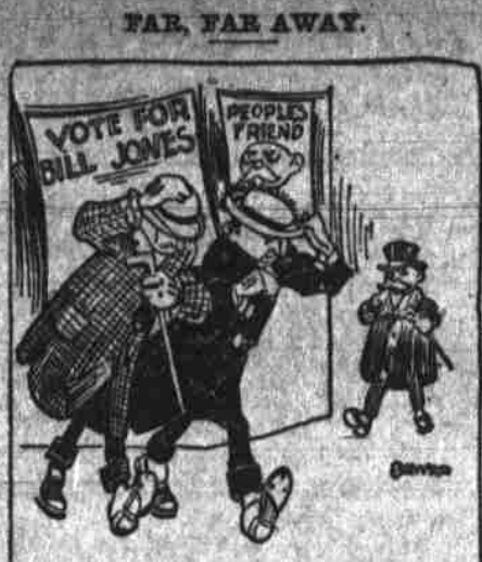
Hewitt—"Did the election go to suit you?" Jewett—"Sure. That guy they elected is a creditor of mine and now he'll have to go and live in Washington."