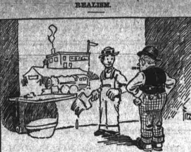
Stage Manager—"I didn't tell you I wanted a railroad pictured in that scene." Scene Painter (realist)—"But how do you suppose that hotel in the distance can get any patronage unless they have some transportation?"