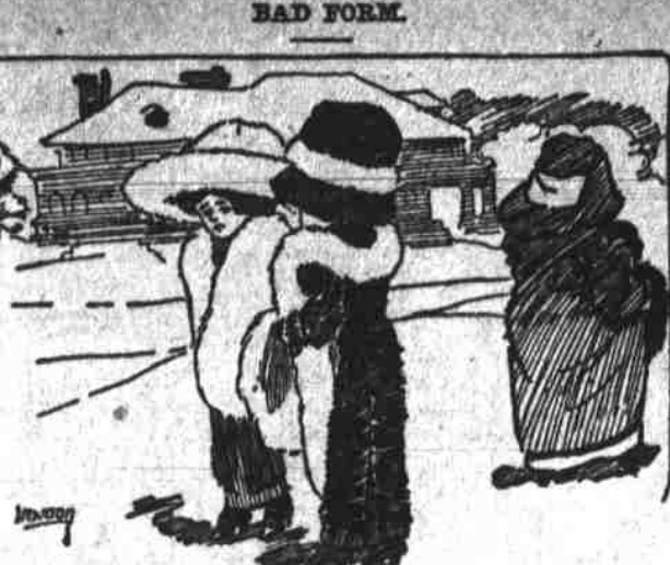
Maria Brighteyes—"There goes Mrs. De Shriek, the great singer, in her street clothes." Bella Beane—"Why does she wear street clothes when she's walking on the sidewalk?"