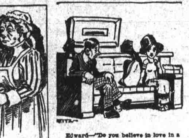
Edward—"Do you believe in love in a cottage?" Hortense—"If the cottage is a bungalow in a fine neighborhood, is well furnished and has a garage in the rear."