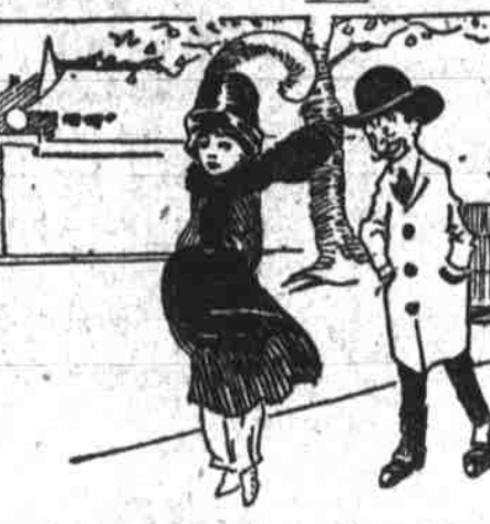
Mr. Askit—"How do you know Kate and Kitty are avowed enemies?" Miss Knosit—"Because I heard Kitty say that Kate has a lovely character."