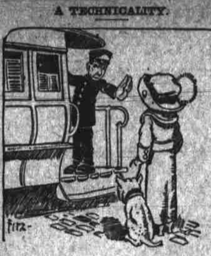
The Conductor—"Lady, we can't let a dog like that ride on this car." The Lady—"I know he hasn't got his best collar on but the passengers won't care."