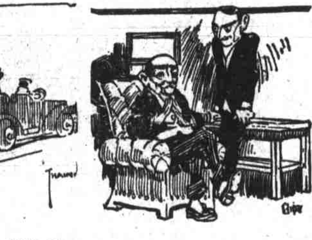
Jinks—"Money talks!" Binks—"Especially when tight."