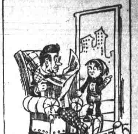
A FIT SUBJECT.

Willie—"Papa, Fido was just hit by a taxi." Papa—"All right, Willie, telephone for a taxidermist."