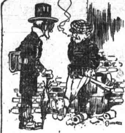
"CRUEL AND UNUSUAL."

The Sociologist—"Did the fear of further imprisonment cause you to reform?" The ex-Yegg—"It wasn't so much that but dey got a lot o' women on de prison board an' I heard dey was goin' to design de prison uniforms."