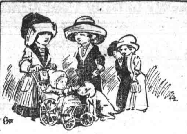
THE LAST STRAW.

Miss Harte—"Oh, I'm so glad to see you. I want to know what breakfast food you give baby. I was just coming over to your home to ask you." Mrs. Carter—"Why? Are there children at your house?"