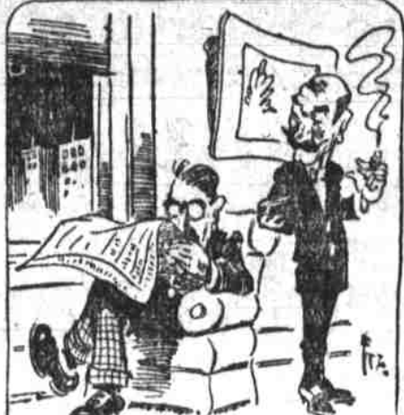
REVERSING USUAL PROCESS.

Howell—"Here's a queer state of affairs." Powell—"I don't know what it is, but I can beat it; I heard of a man to-day who mortgaged his automobile to buy a house."