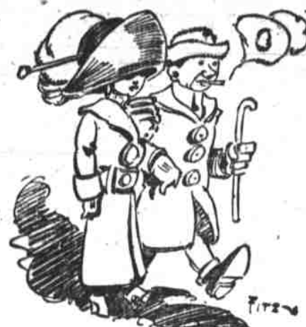
HE ONLY HAS A CENT.