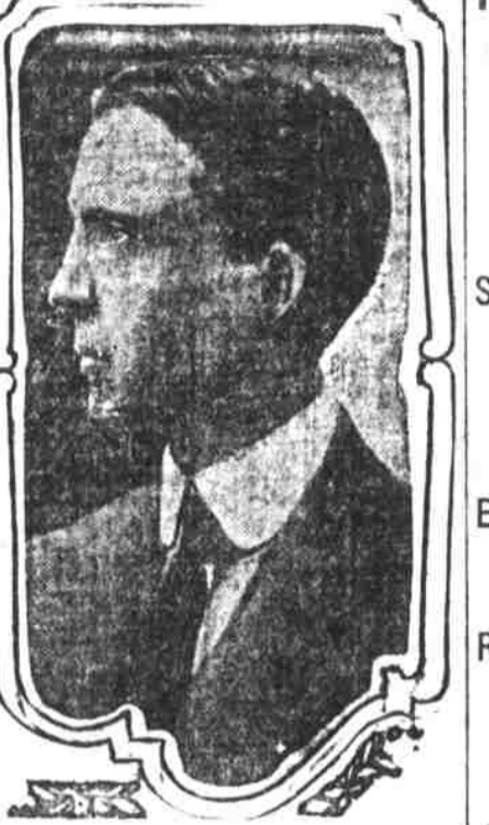
Governor Benjamin W. Hooper of Tennessee.