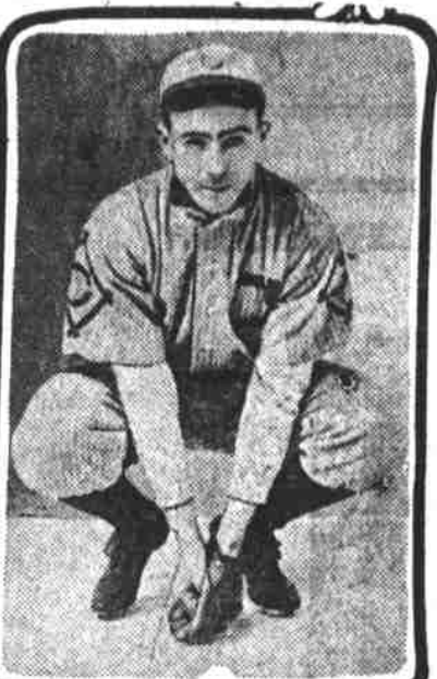
Joe Tinker, famous shortstop of Chicago Cubs, who is "catching" laughs before footlights at Empress theatre this week.

then went into the dives of the north end in Portland and employed crooks no more fitting place could be found to employ men to fight education. If other interests are backing him all are equally guilty."