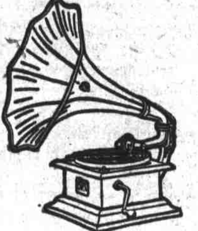
Victor I $25

$10, $17.50, $25, $32.50, $40, $50, $60, $100.