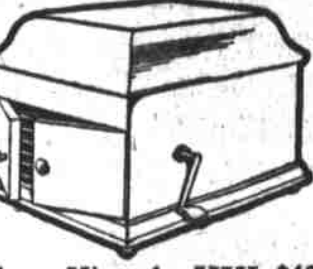
Victor-Victrola VIII $40

Wholesale and Retail Sherman Clay & Co Morrison at Sixth Streets