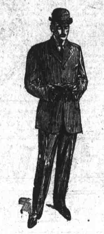
Suits $25 to $40