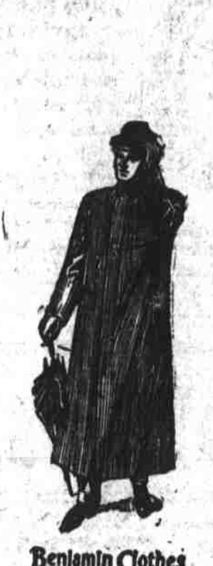
Raincoats $20 Up