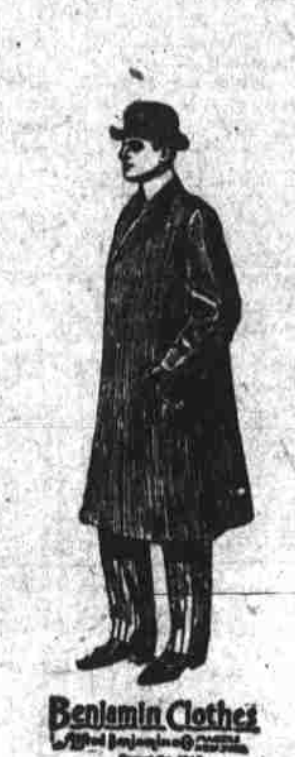
O'Coats $25 to $50