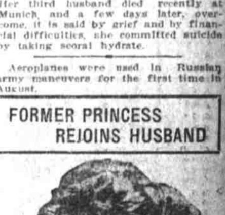
The former Crown Princess Luise of Saxony and her husband, Prince Louis, with the painter, Wilhelm von Humboldt, and her husband, from whom she was separated for some considerable time, are again living together and are occupying a villa at Plochingen. Reports were current that they were proceeding to be married, but this has been disproved and they are appearing in public and again robbing.

Acrobates were used in Russian army maneuvers for the first time in August.