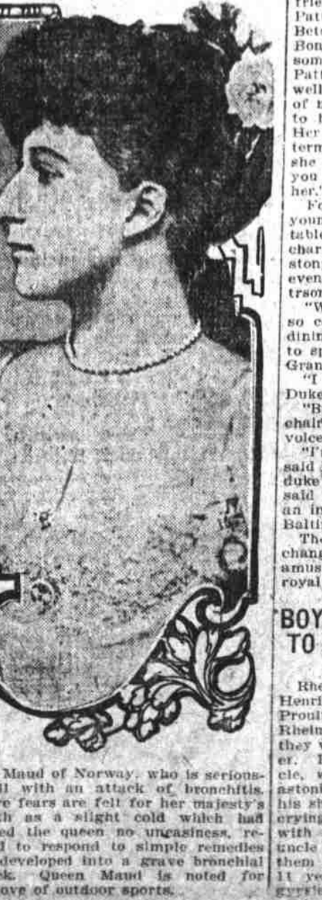
Queen Maud of Norway, who is seriously ill with an attack of bronchitis. Grave fears are felt for her majesty's health as a slight cold which has caused the queen no uneasiness, refused to respond to simple remedies and developed into a grave bronchial attack. Queen Maud is noted for her love of outdoor sports.