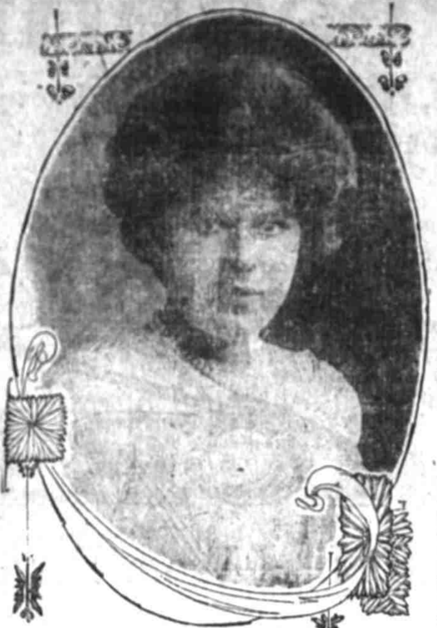
Signora Marconi, the wife of Marconi, the inventor of wireless telegraphy, who has been appointed a lady-in-waiting to Queen Helena of Italy.