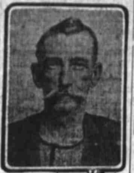
"Old Bill" Miner, who has escaped from another prison.

"Old Bill Miner," Who Has Been Real Terror to Express Companies for 40 Years, Is Once More at Large.