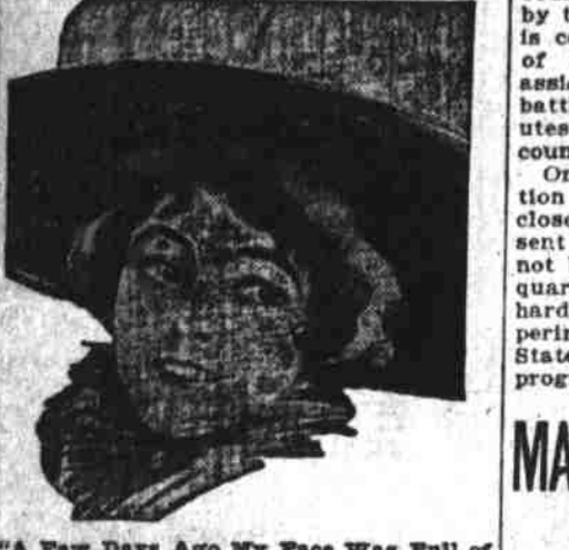
"A Few Days Ago My Face Was Full of Pimples, Now They're All Gone! I Used Stuart's Calcium Wafers."

Trial Package Sent Free to Prove It. No need for anyone to go about any longer with a face covered with pimples, blotches, eruptions, blackheads and liver-spots. These are all due to