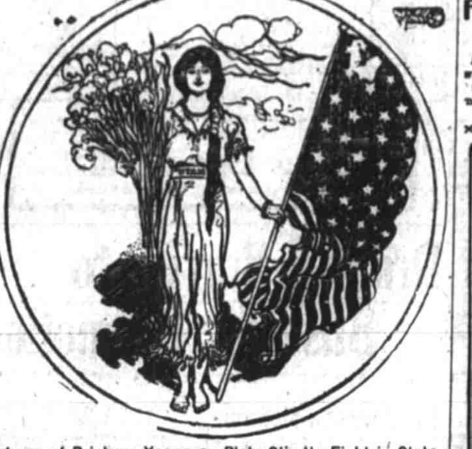
Features of Brigham Young on Plate Stir Up Fight in State of Utah—Women Take Part.