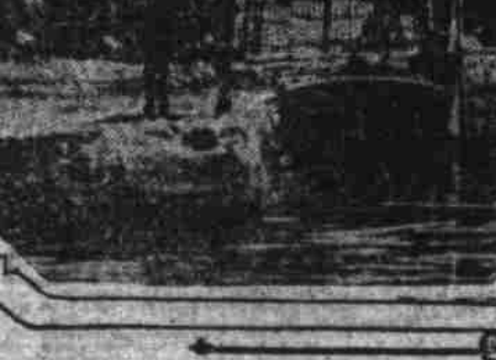
View of portion of the harbor of Tripoli before the bombardment.