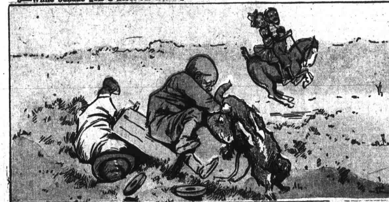
7—Billy gets tired of his job and bucks.