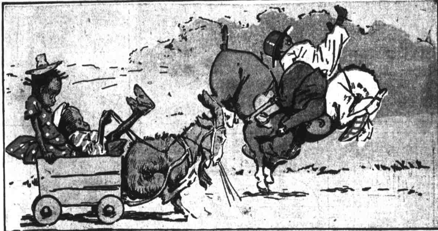
2—But just then Billy had to stop and sneeze.