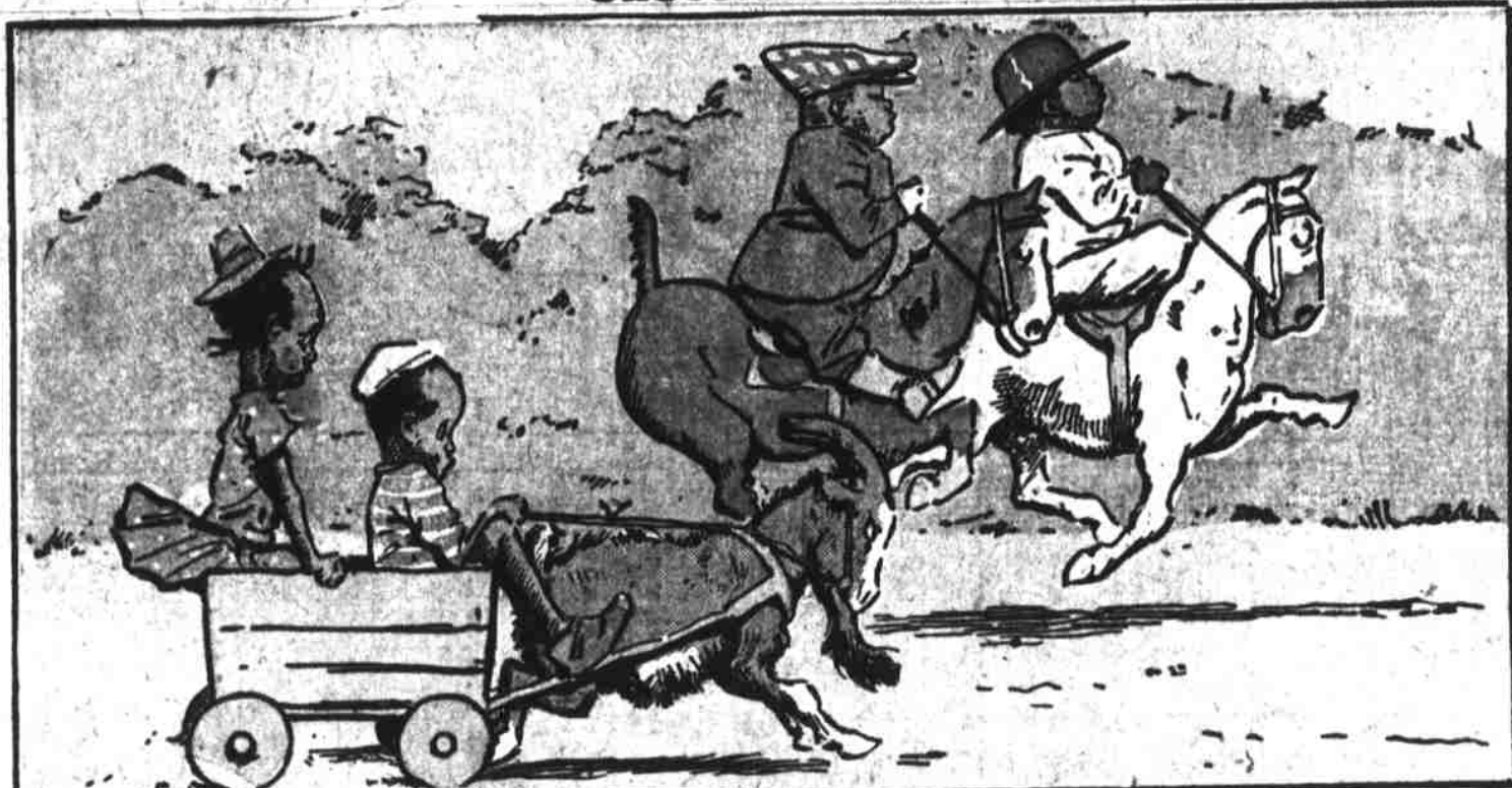
1—"Make out like yer don't see dem common trash."

Copyrighted, 1911, by the American-Canadian Over British Rights Reserved