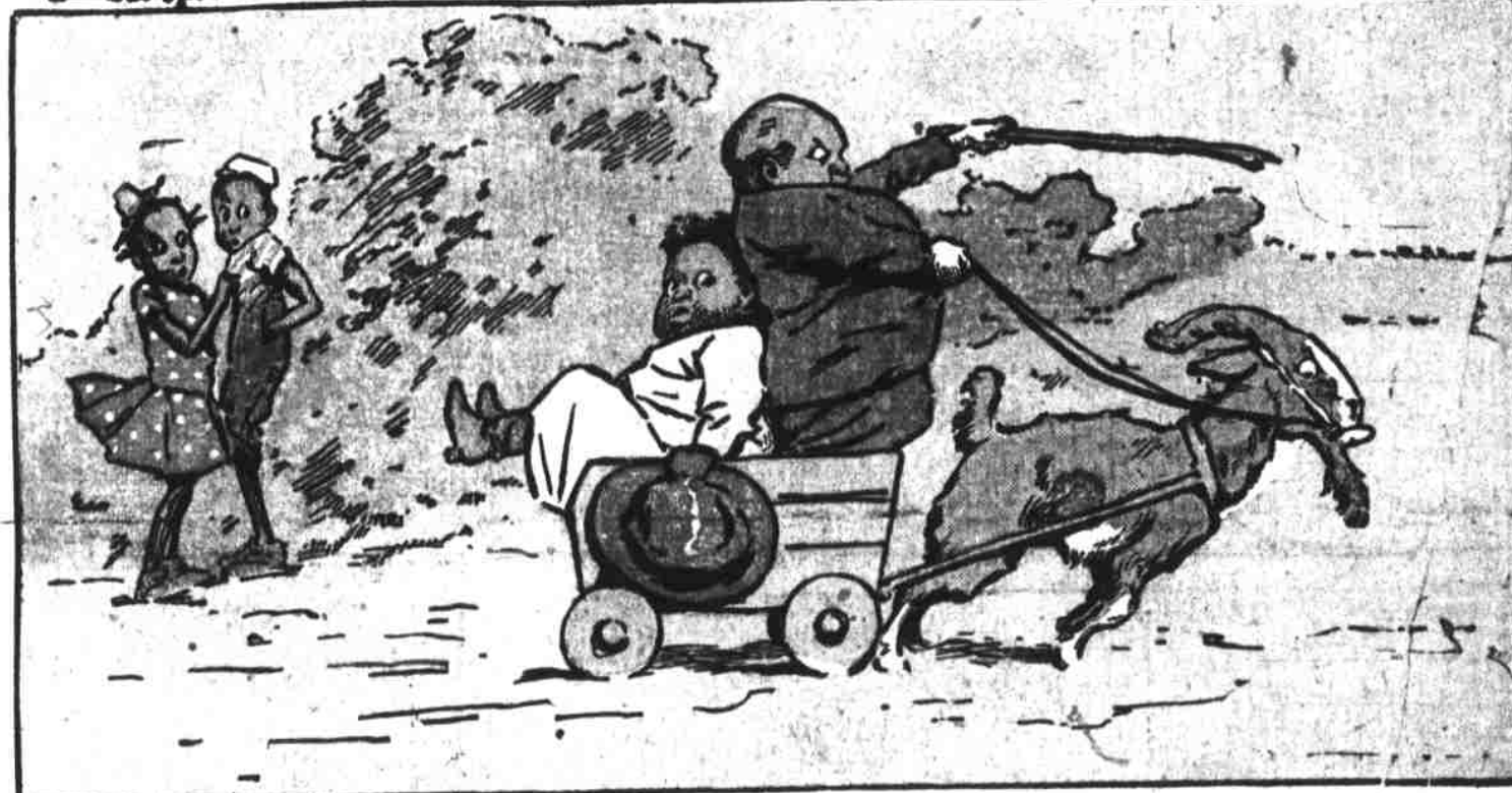
4—And makes a bee line for home—