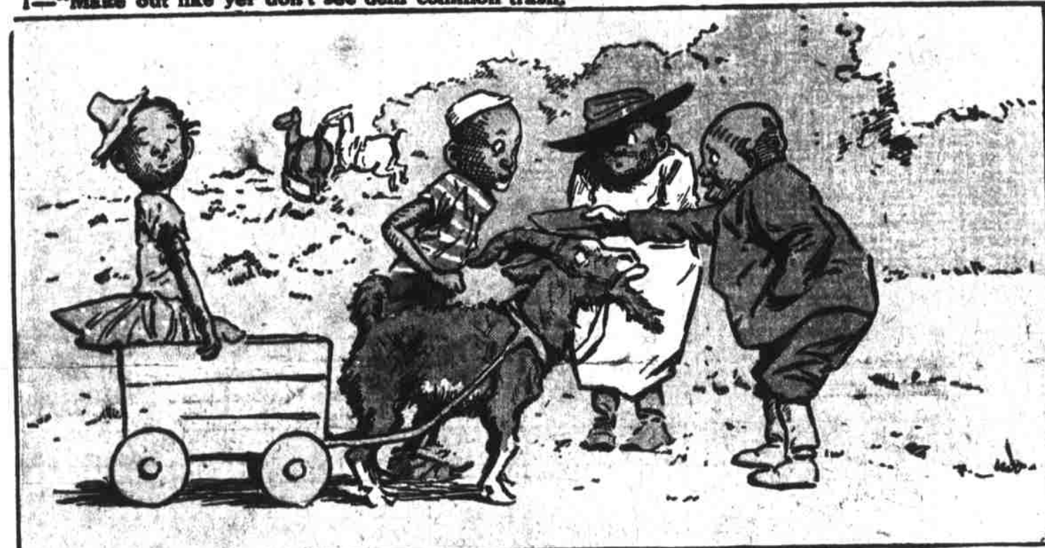
3—"Cutey" hires the goat for a five dollar bill—