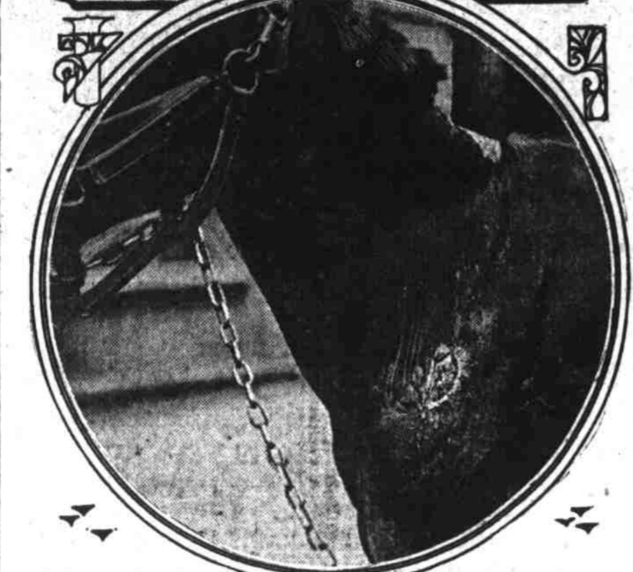
Mules shown here were exhibited to Judge in case in which fines were imposed on offenders.