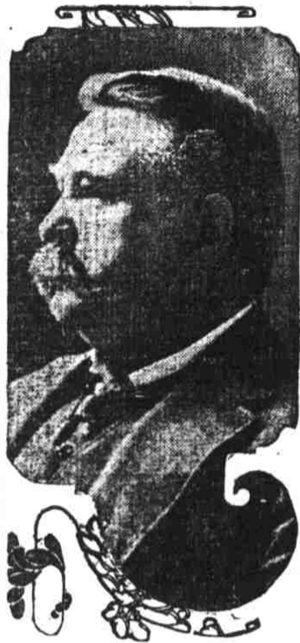
John W. Gates, Whose Sickness Alarms His Friends.

(United Press Leased Wire.) Paris, July 8.—Irrespective of the secrecy maintained at Hotel Maurice, it is known here today that John W. Gates is a very sick man and his recovery is regarded as doubtful. Five physicians and three nurses are in attendance. Gates has undergone seven operations on his throat.