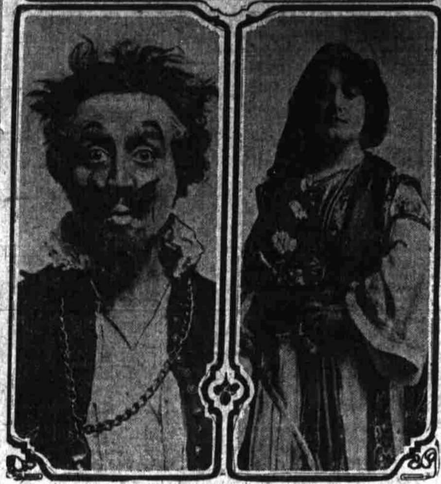
E. H. Sothorn and Julia Marlowe, who will soon appear at Heilig theatre

Off the stage, Miss Julia Marlowe is perhaps the least recognized of any feminine celebrity, as she has made a study of hiding her identity when away from the footlights as much as possible. She is a great walker, but few people who meet her, well-hidden and in modest garments, discern it is the foremost Shakespearean actress of the day passing them.