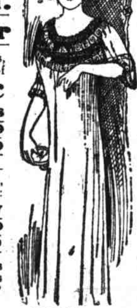
ORDER BY MAIL