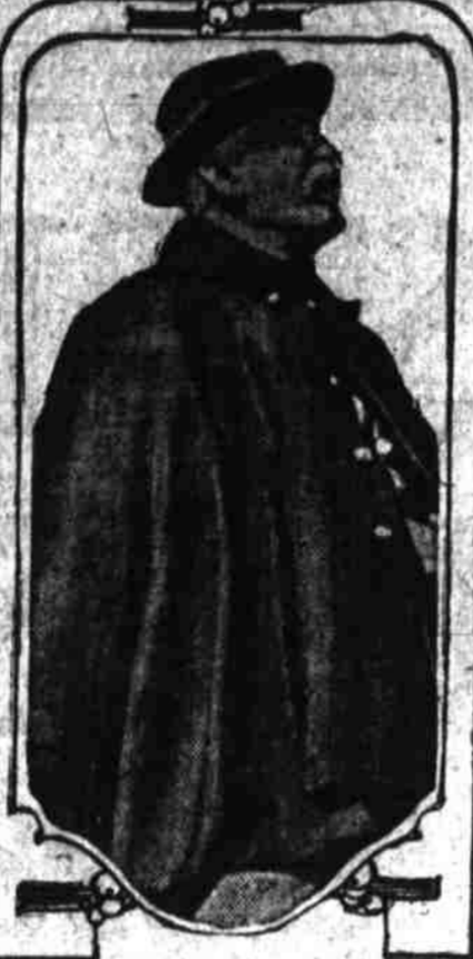
General Navarro, commander of the Mexican federal troops at Juarez, who was sent over the border by General Madero when his life was threatened by officers of the insurgent army.