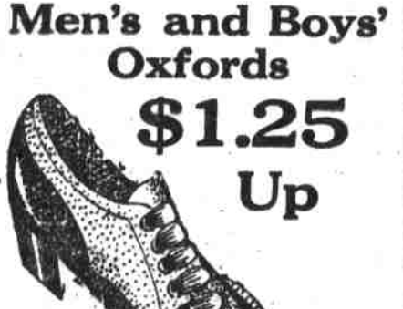
Some of these are up to $5 vals., all colors and shapes.

Women's and Children's Oxfords and Pumps 25c Up