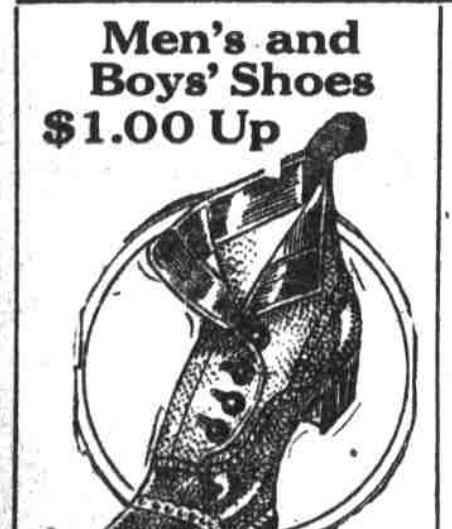
Patent, gunmetal and vici, lace and button.

In this stock are thousands of pairs of new 1911 styles of Men's, Women's and Children's Shoes, Oxfords and Pumps.