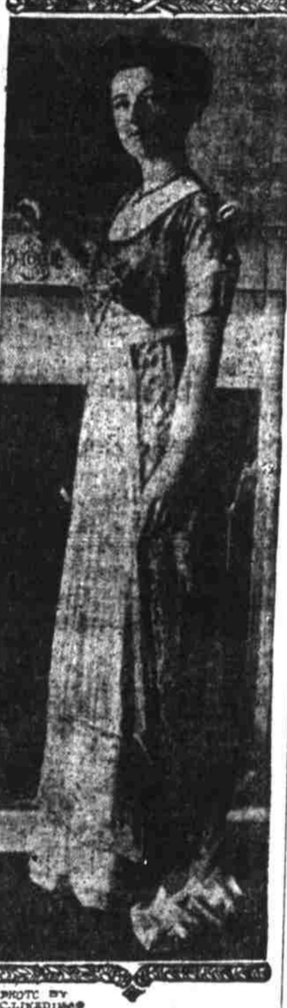
Miss Helen Taft—Latest picture of the president's daughter, taken in the red room at the White House. Miss Taft's gown is of "Helen" Pink. The photograph is her favorite one.

The Kappa Alpha Theta sorority has been granted a charter for an alumnae chapter to be known as the Omega Alumnae. The membership is some, and thing over 30, with representatives