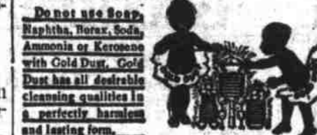
"Let the GOLD DUST TWIN do your work!"

If you could see your dishes and household utensils through a microscope you would realize that mere soap and water is insufficient to do more than wash off the surface. GOLD DUST not only cuts dirt and grease with scarcely any rubbing, but is an antiseptic that cuts deep after every hidden impurity and germ. GOLD DUST sterilizes your kitchen things, and makes them wholesome and sanitary. GOLD DUST is the greatest labor-saver known.