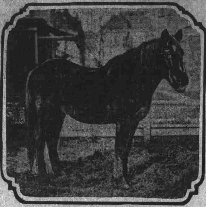
"Autocrat," aged horse.