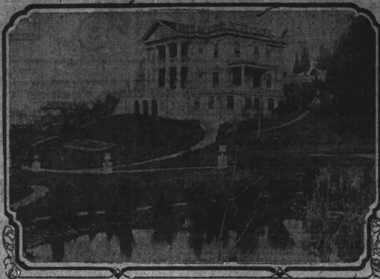
New view of Massachusetts building on west slope of Mount Tabor, recently purchased for a home by B. S. Josselyn, president of the Portland Railway, Light & Power company. The building is to be altered and the grounds improved to an extent that will involve an expenditure of approximately $15,000.