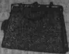
Latest Avenue Shape

—An entirely new and comends for embroidering in seal or walrus grain and patent leathers. All are more lined and have double outside pockets, metal frames in gold or silver finish, strap handles. Fitted with change purse. Eight to ten-inch sizes.