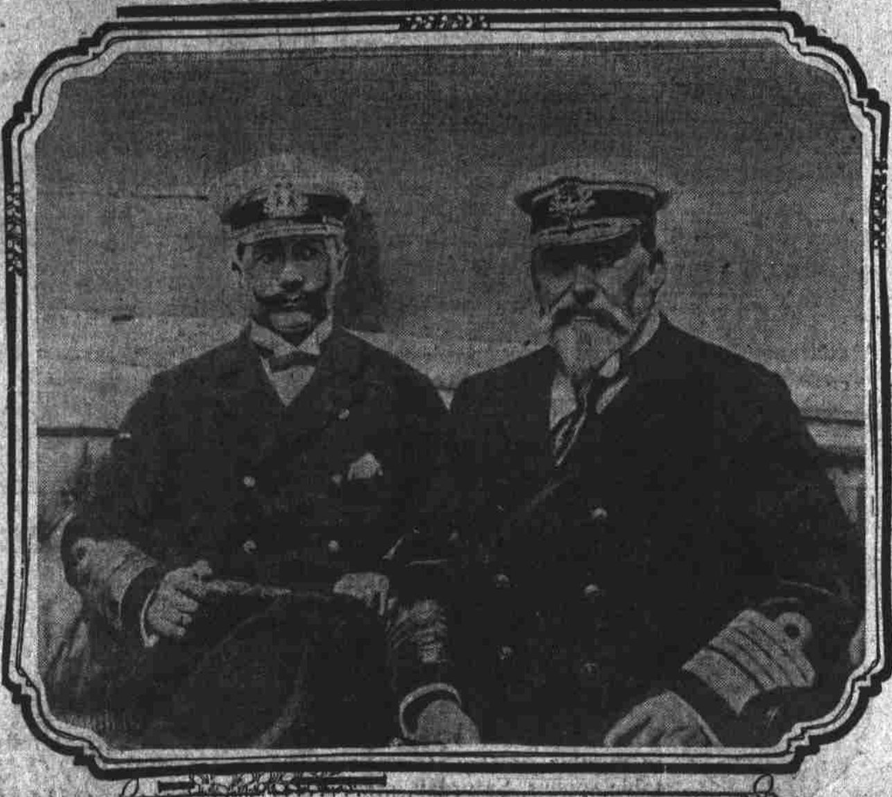
The King of England and Emperor of Germany. The photograph was taken at the Kiel regatta.