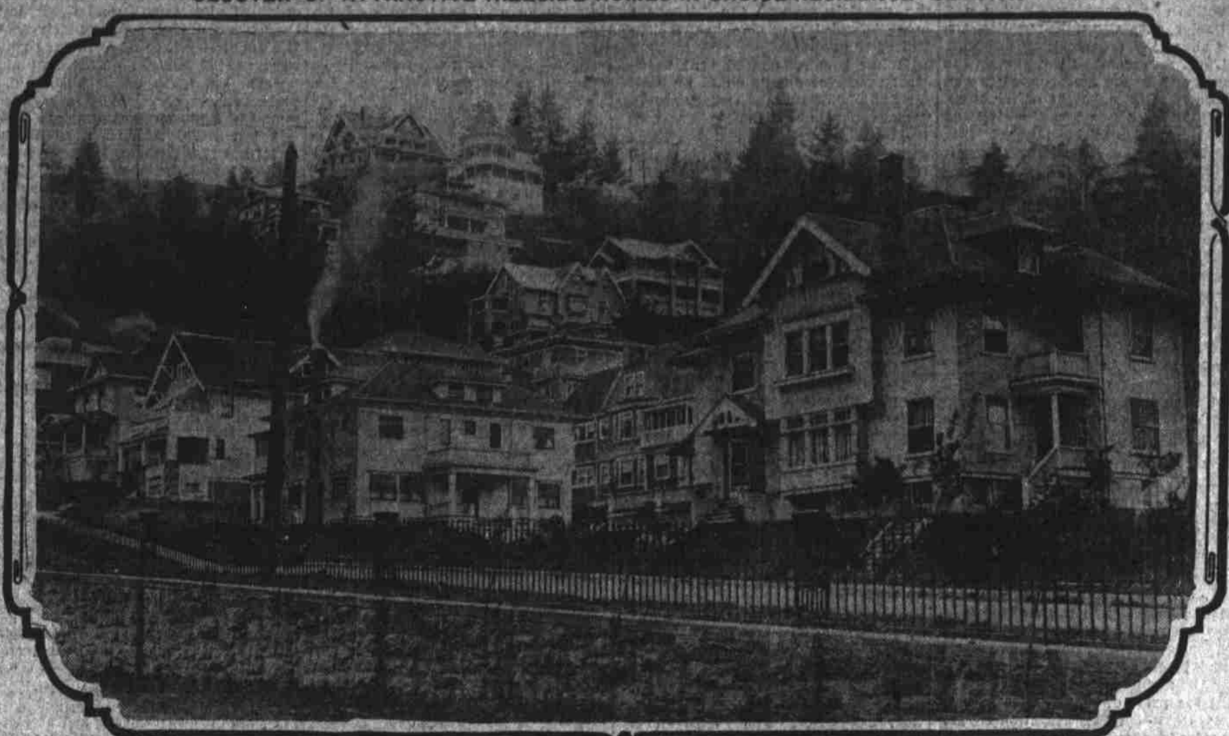
Looking southwest from Thirteenth and Harrison streets, showing the remarkable upbuilding of the foothills adjacent to Portland Heights. Every building with three exceptions shown in the foreground has been erected within the past two years, while three years ago this entire hillside was bare of improvements.