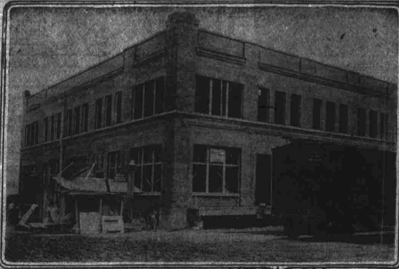
Warehouse under construction by Page & Son at East First and Belmont streets.

Heights covered by elegant, palatial homes; a hotel covering at least five acres of ground will be located thereon, giving all guests a view unsurpassed on earth.