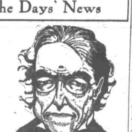
SAMUEL GOMPERS.

Published every Sunday (except Sunday) and every Friday morning at the Journal Building, Fifth and Yamhill streets, Portland, Or.