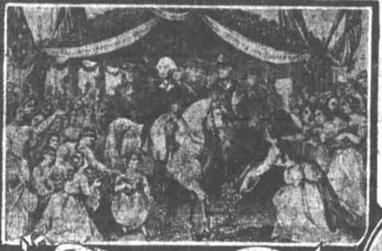
WASHINGTON ON THE BRIDGE AT TRENTON.