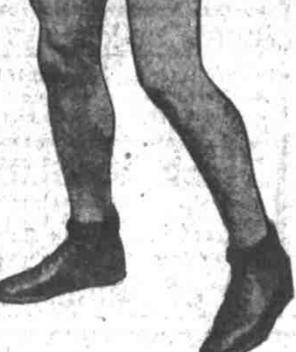
Abe Attell, the featherweight champion, who, it is said, will decline to fight Owen Moran next month, owing to the latter's recent defeat at the hands of Matty Baldwin. It is probable that Jim Driscoll will meet Attell.