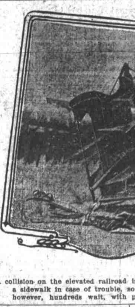
A collision on the elevated railroad in New York during the recent blizzard. Passengers have access to a sidewalk in case of trouble, so that they may proceed to the nearest station. Regardless of this, however, hundreds wait, with primitive curiosity, to see "what the trouble is."

but including bundles of parcels of other mail matter. He quotes J. S. Black, attorney general, June 3, 1888, as upholding the contention that to the government legally belongs the carrying of both parcels of letters and other mail matter.