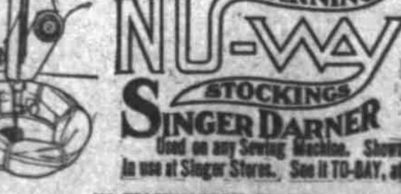
102 WASHINGTON STREET You Can Got Free Lesson