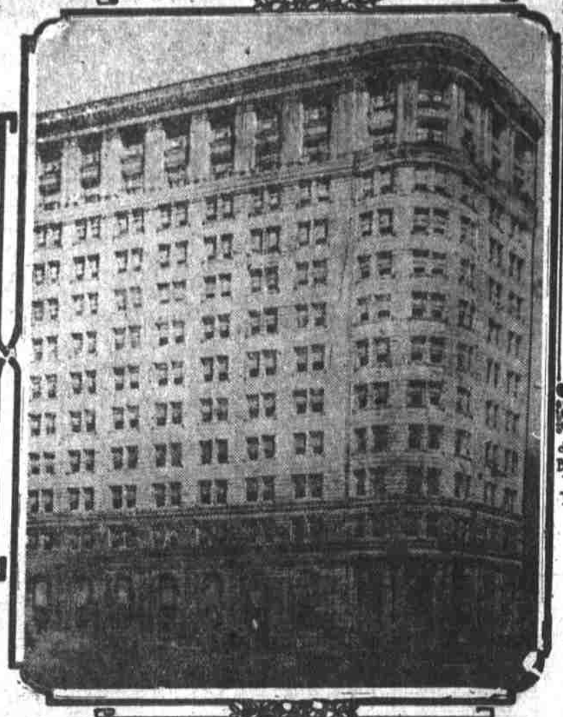
EARTHQUAKE PROOF CONSTRUCTION IN SAN FRANCISCO.

New United Electric Railway The new United Electric Railway, which is to be built between the city and the river, is now under construction.