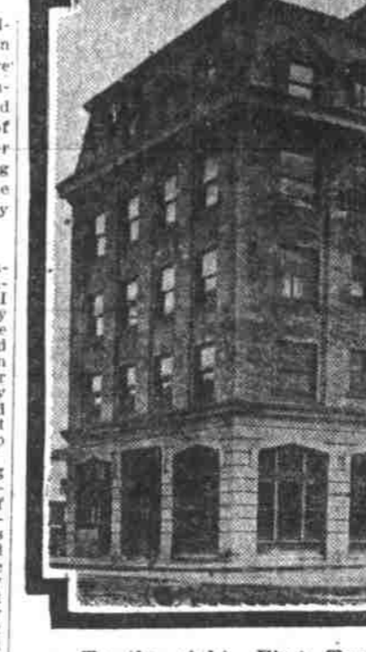
CHANDLER HOTEL, Marshfield, Or.